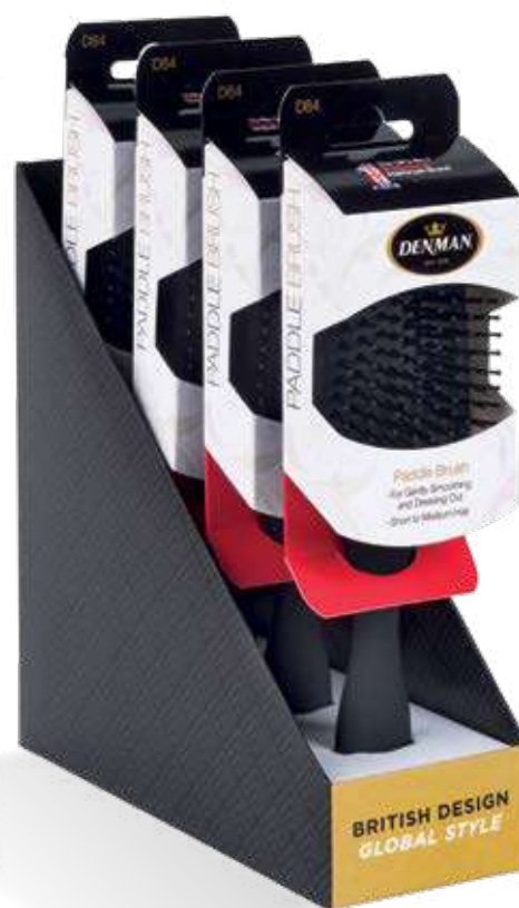
D84 4 PC RETAIL DISPLAY P084RDBK