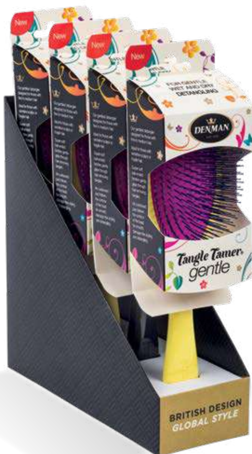
D93 4 PC RETAIL DISPLAY D093DBKY