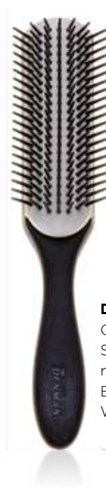
D3N Original Styler 7 row Black/ White