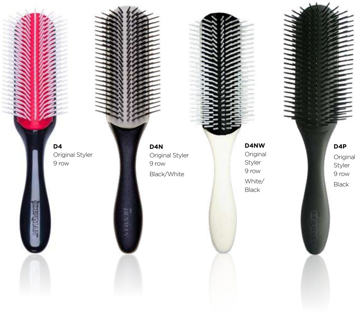
D4 Original Styler 9 row