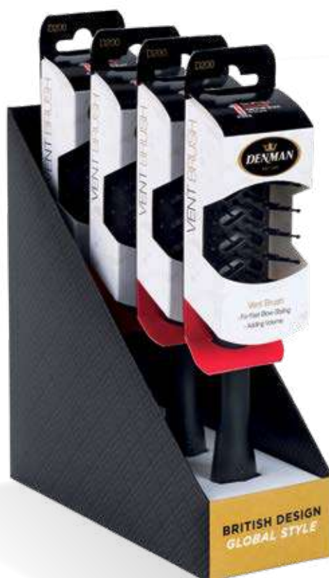
D200 4 PC RETAIL DISPLAY F200RDBK