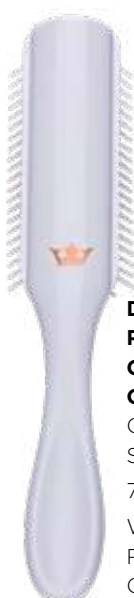
D3 ROSE GOLD CROWN Original Styler 7 Row White Rose Gold Crown