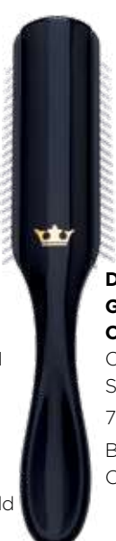
D3 GOLD CROWN Original Styler 7 Row Black Gold Crown