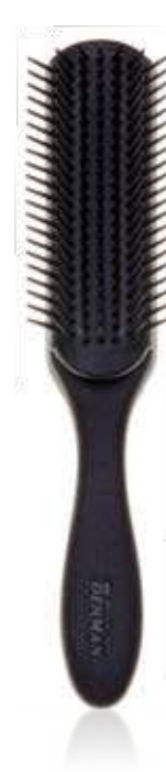
D3M Original Styler 7 row Black