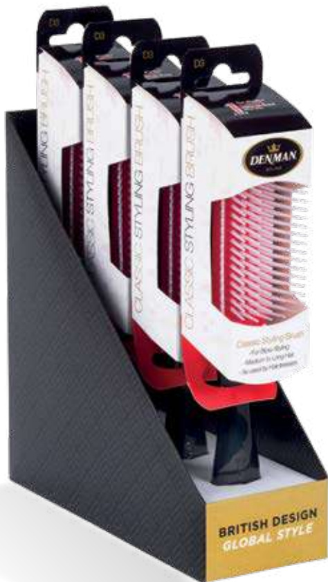
D3 4 PC RETAIL DISPLAY T003RDBK