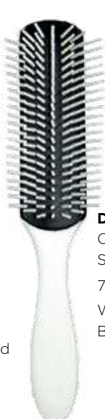
D3NW Original Styler 7 Row White/ Black