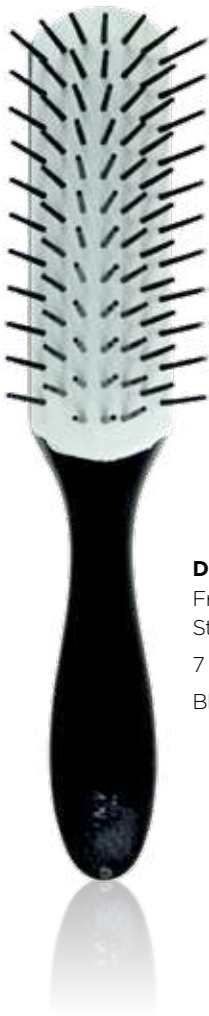
D31N Freeflow Styler 7 Row Black/White