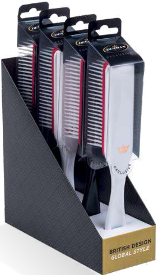
D3 CROWNS 4 PC RETAIL DISPLAY T003DBWC