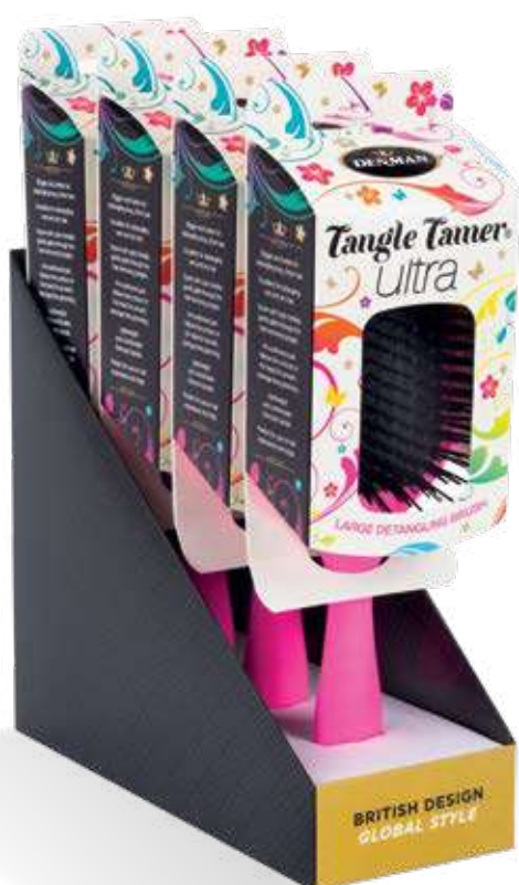
D90L 4 PC RETAIL DISPLAY D090LDPK