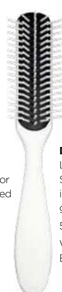
D143NW Long Styler for increased grip 5 row White/ Black