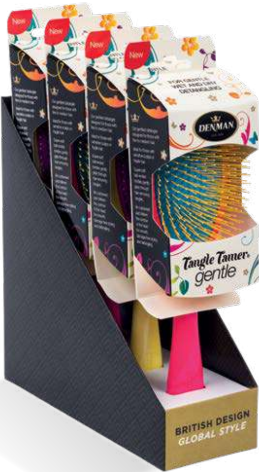
D93 4 PC RETAIL DISPLAY D093DPKY