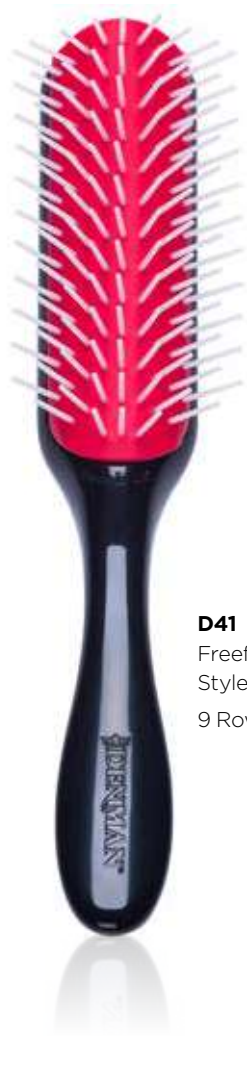
D41 Freeflow Styler 9 Row