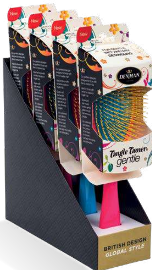
D93 4 PC RETAIL DISPLAY D093DBLP