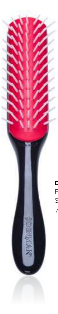
D31 Freeflow Styler 7 Row