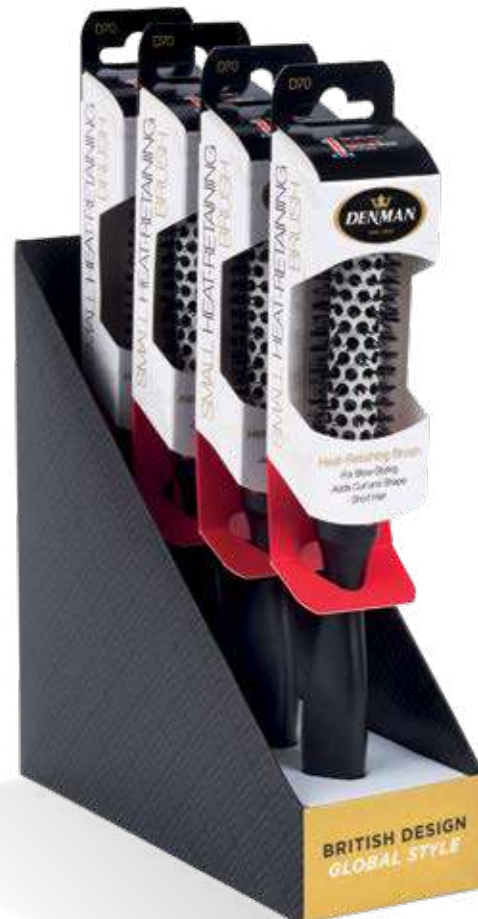
D70 4 PC RETAIL DISPLAY D070RDBS