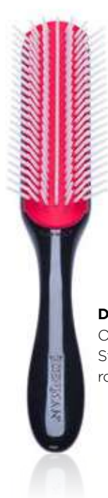
D3 Original Styler 7 row